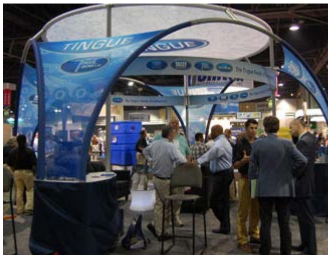
Busy Booth at Clean '15.

What a show! This Clean show broke attendance records and we're proud and grateful to report that it felt like most of the attendees were in our booth. Warm thanks to everyone who stopped in to see our new products and say hello. We always enjoy the opportunity to see old friends and colleagues. For those of you we missed in Atlanta, we hope to see you in Las Vegas, and here are some highlights: